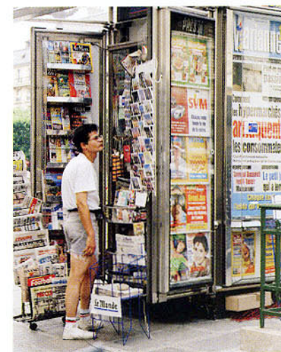
Spiral, clockwise from top left: John Miller, Untitled (11-19-04), color photograph, 8 ½ x 11". John Miller, Untitled (08-15-95), black and white photograph, 8 x 10". John Miller, Untitled (01-20-05), color photograph, 11 x 8 ½". John Miller, Untitled (05-21-05), color photograph, 8 ½ x 11". John Miller, Untitled (07-16-97), color photograph, 10 x 8". John Miller, Untitled (05-30-05), color photograph, 8 ½ x 11". John Miller, Untitled (06-06-97), color photograph, 10 x 8". John Miller, Untitled (01-20-05), color photograph, 8 ½ x 11". John Miller, Untitled (06-11-97), color photograph, 10 x 8". From The Middle of the Day , 1994--.